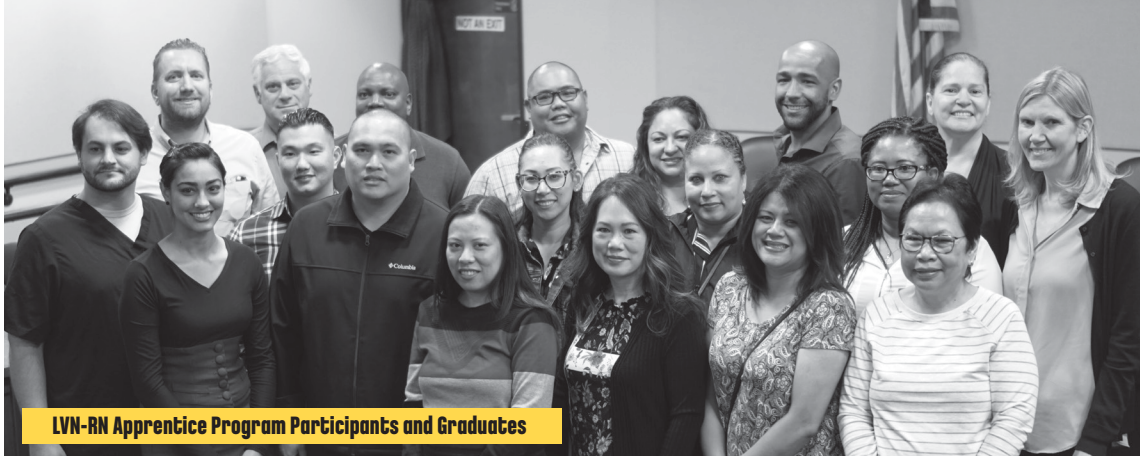
LVN-RN Apprenticeship Program Participants and Graduates