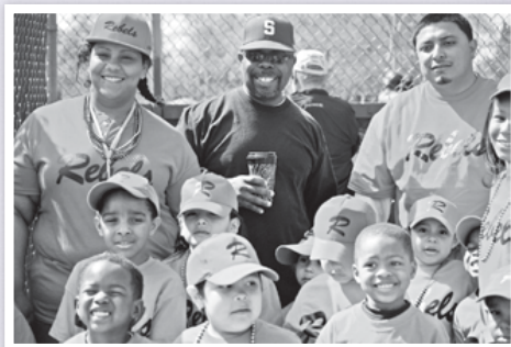
In Sacramento, dozens of volunteers renovated a Little League baseball diamond that is used by thousands of area kids.