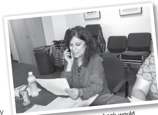
Even your ability to phone bank would be restricted by this initiative.

In 2010, the U.S. Supreme Court ruled that it is illegal to limit political donations by corporations. This helped wealthy special interests gain more power in an environment where they already outspend labor by a 3-1 margin in direct contributions and a 15-1 margin