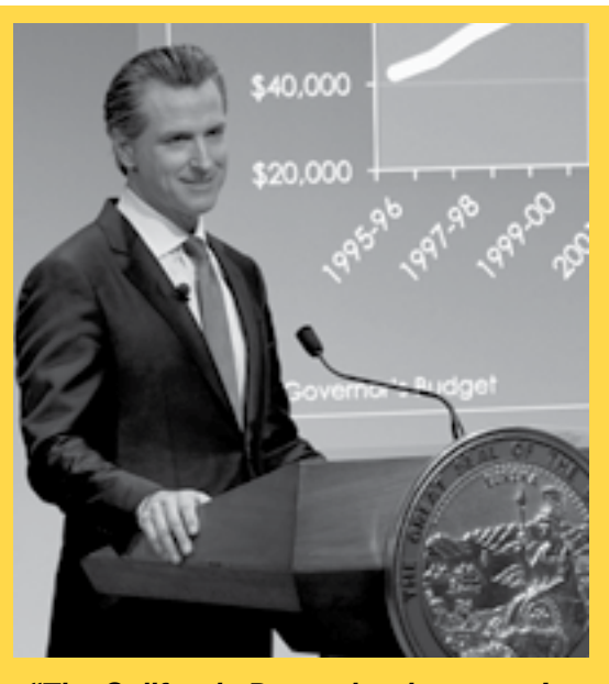
"The California Dream is a house we're building together. The budget we're proposing makes that dream available to all." - Gov. Gavin Newsom

Gov. Gavin Newsom's first proposed state budget is a win for working families and all Californians, keeping a strong focus on fiscal responsibility while adding programs that mirror our union's fight for social and economic justice.