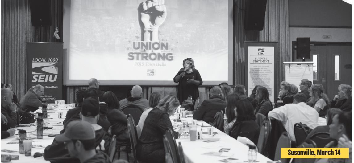
Susanville, March 14