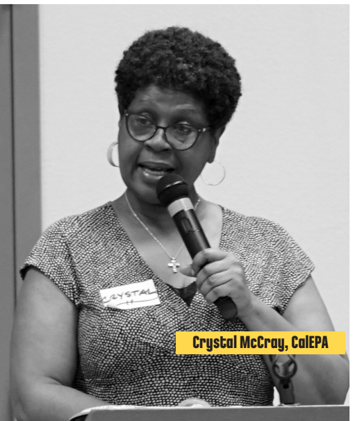
Crystal McCray, CalEPA