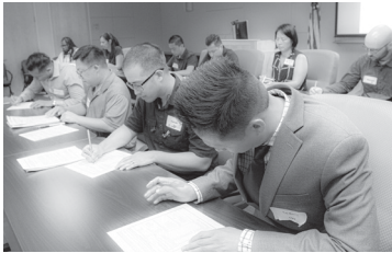
New apprentices enter the program 8/20/19

We created these "first of their kind" apprenticeships because upward mobility is a union value. We've developed close partnerships with a number of state agencies and community colleges across the state, generating more than $10 million in grants in our effort to build a California for All